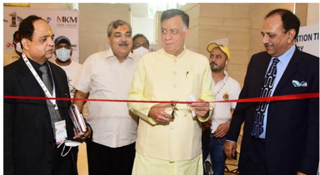
Sh. Satish Mahana, Industry Minister, U.P.