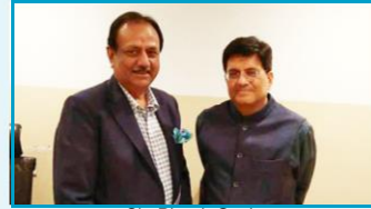
Sh. Piyush Goel, Union Minister of Commerce, Industry, Textiles & Consumer Affairs