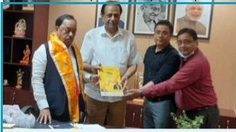
Sh. Narayan Rane, Union Minister of MSME