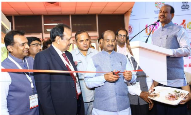
Sh. Om Birla, Speaker of Indian Parliament