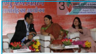
Smt. Smriti Irani, Minister of Women & Child Development addressing the Expo-Summit