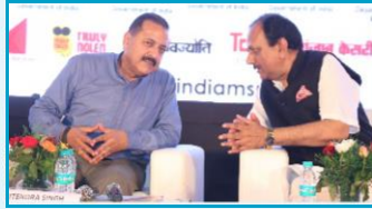
Dr. Jitender Singh Union Minister (MOS) Prime Ministers Office (PMO)