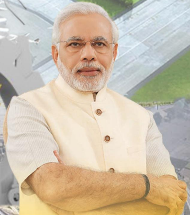
Shri Narendra Modi Hon'ble Prime Minister of India

B2G/B2B MEETS - NETWORKING NEW OPPORTUNITIES