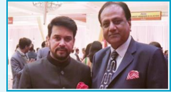
Sh. Anurag Thakur, Union Minister of I&B, Youth Affairs & Sports