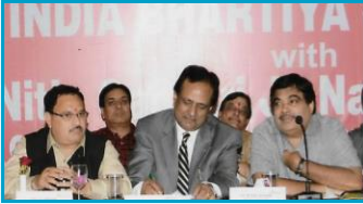
Sh. Nitin Gadkari, Union Minister of Road Transport & Highways