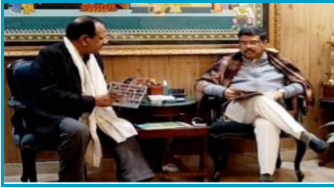
Sh. Dharmendra Pradhan, Union Minister of Skill Development & Entrepreneurship