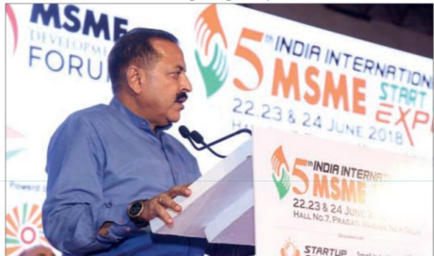
Dr. Jitender Singh, Union Minister (MSO) Prime Minister Office (PMO) & DONAR