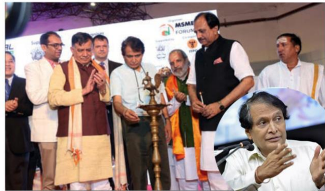
Sh. Suresh Prabhu, Union Minister of Railways, Commerce & Industry with Sh. Satish Mahana, Industry Minister, UP & Sh. Jai Bhagwan Goel Inaugurating 5th Expo