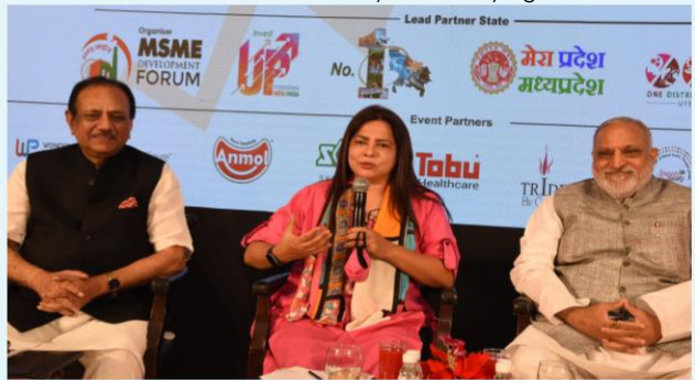
Smt. Meenakshi Lekhi, Minister of State for External Affairs and Culture