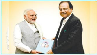
Sh. Narendra Modi Prime Minister of India