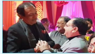
Sh. JP Naddha, President of Bhartiya Janta Party