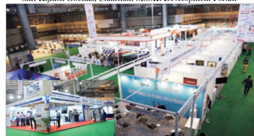
Aerial View of MSME Expo - 2014