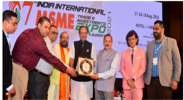
Dr. Jitender Singh Union Minister (MOS) Prime Ministers Office (PMO)

17-18-19 AUGUST 2021, HOTEL LE MERIDIEN, DELHI