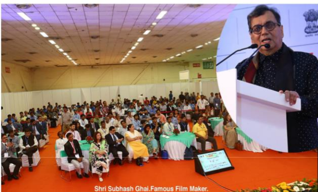
Shri Subhash Ghai, Famous Film Maker.