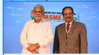
Sh. Parshotam Rupala Union Minister of Animal Husbandry, Dairying & Fisheries