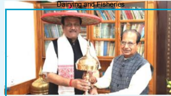
Sh. Jagdish Mukhi, Governor of Assam