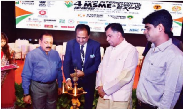
Dr. Jitender Singh Union Minister (MOS), Prime Ministers Office (PMO), Sh. Satish Mahana, Industry Minister, UP Sh. Rajnish Goenka, Chairman of MSME - DF Inaugurating 4th Expo