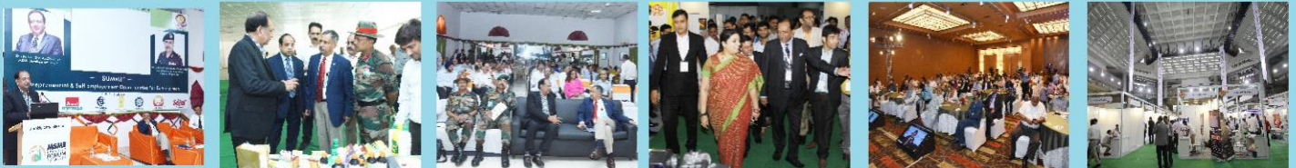
Retiring & Ex.Armymen entrepreneurial opportunities Expo & SUMMIT