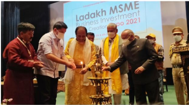
Sh. Parshottam Rupala, Minister of Fisheries, Animal Husbandry and Dairying Sh. R. K. Mathur, Lieutenant Governor of Ladakh