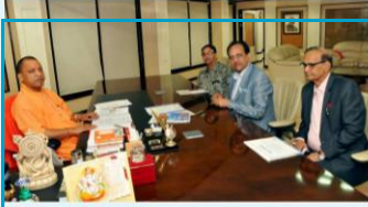
Sh. Yogi Adityanath, Chief Minister of Uttar Pradesh