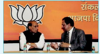
Sh. Rajnath Singh, Union Defence Minister