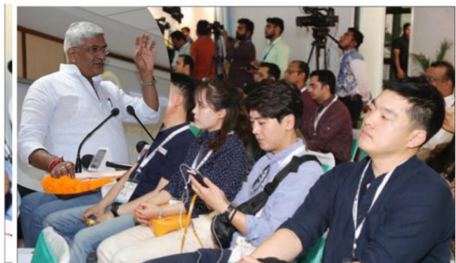
Sh. Gajendra Singh Shekhawat, Union Cabinet Minister of Jal Shakti (Water Resources) With Foreign Delegates, delivering Keynote address on opportunities in Water Resources Management in India