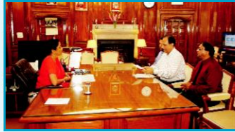
Smt. Nirmala Sitharaman, Union Finance Minister