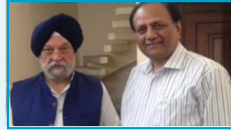
Sh. Hardeep Singh Puri Union Minister of Housing & Urban Affairs