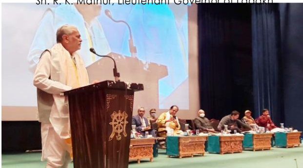
Sh. Parshottam Rupala, Minister of Fisheries, Animal Husbandry and Dairying