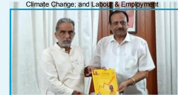
Shri Krishan Pal Gurjar, MOS-Heavy Industries & Public Enterprises & Power