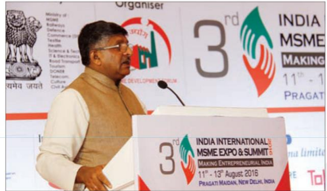
Sh. Ravi Shankar Prasad, Union Cabinet Minister for I.T, ITEs, Electronics & Law, deliberating on Ease of doing business policies & new opportunities in India