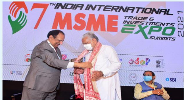
Shri Parshottam Rupala, Minister of Fisheries, Animal Husbandry and Dairying