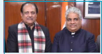
Sh. Bhupender Yadav Union Cabinet Minister for Environment, Forest & Climate Change; and Labour & Employment